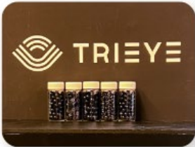
● Visible Camera