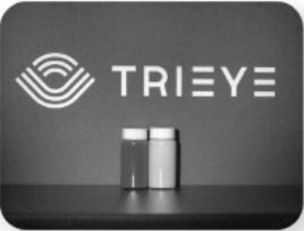
● SWIR Camera