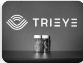
● SWIR Camera