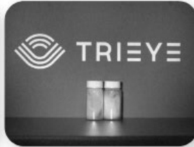
● SWIR Camera