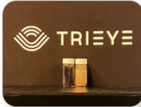
● Visible Camera