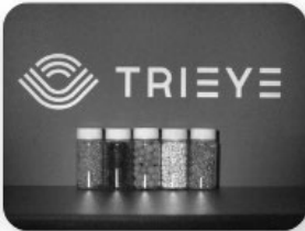
● SWIR Camera