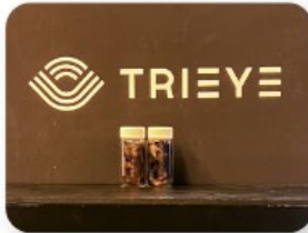
● Visible Camera