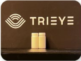
● Visible Camera